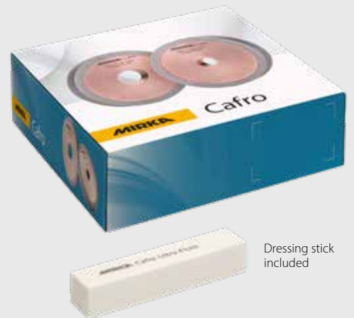
Dressing stick included