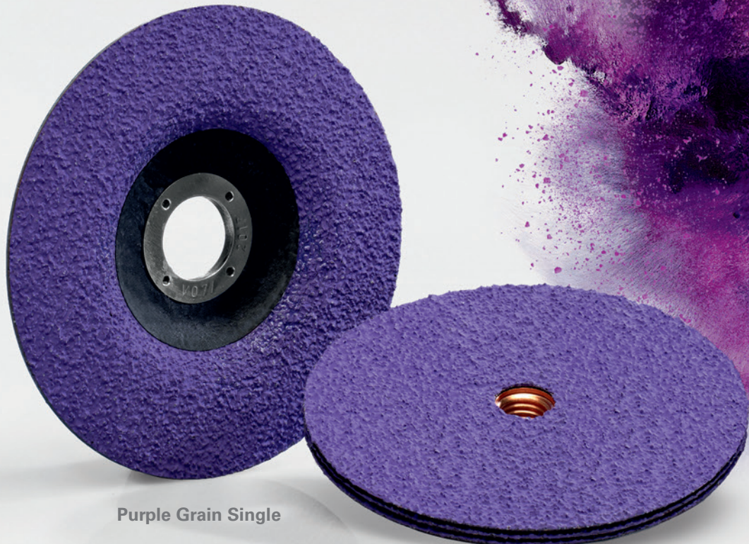
Purple Grain Single