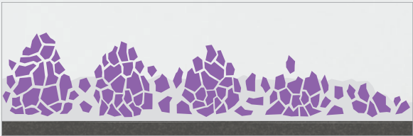
Ceramic grain: aggressive right to the very end