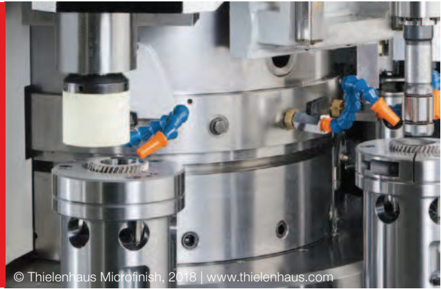
© Thielenhaus Microfinish, 2018 | www.thielenhaus.com